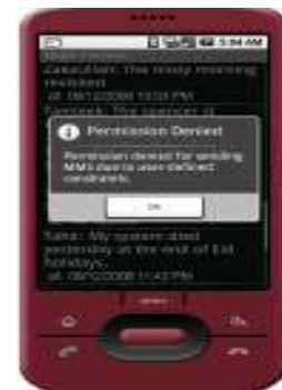
Figure 4. Permission denied as a result of constraint violation.

Note that the inclusion of a new public member field in the PackageManager class constitutes a change in the public API of the Android SDK. A change of this