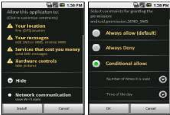
Figure 5. Poly android installer interface.

to click on a specific permission and set the constraints for its usage. The constraints are organized in a user-friendly list of commonly used conditions. Once the user sets these constraints, Poly creates an XML representation of these constraints and store the policy in the system directory from where it can be read during policy resolution. Figure 5 shows the GUI presented to the user when she installs an application.