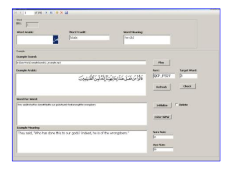
Figure 2. Lexical pattern extraction module.