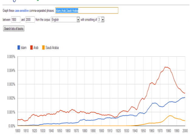
Figure 1. An example of using google n-gram viewer.

However, these terms are getting recently more hits starting from 1950s (as we started seeing books about Arabic countries after occupation, oil discovery and current Middle East conflicts). On the other hand, the term (Saudi Arabia) clearly has no single hit before 1944, twelve years after the birth of the current Saudi Arabia state and hence the term. Such